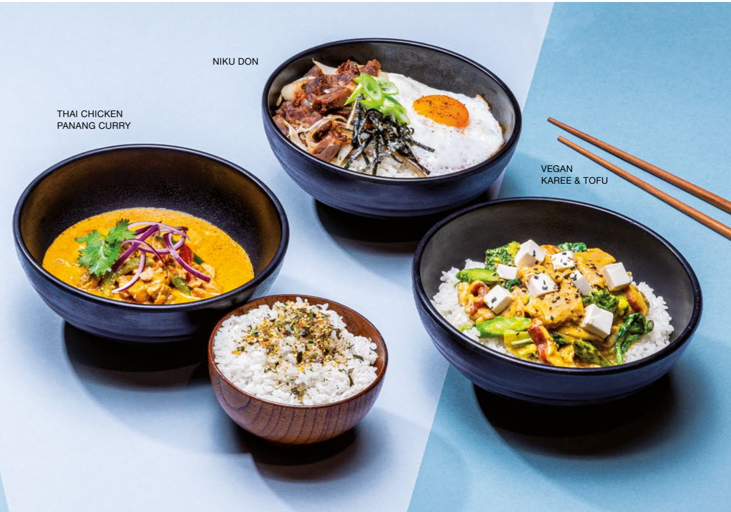
THAI CHICKEN PANANG CURRY