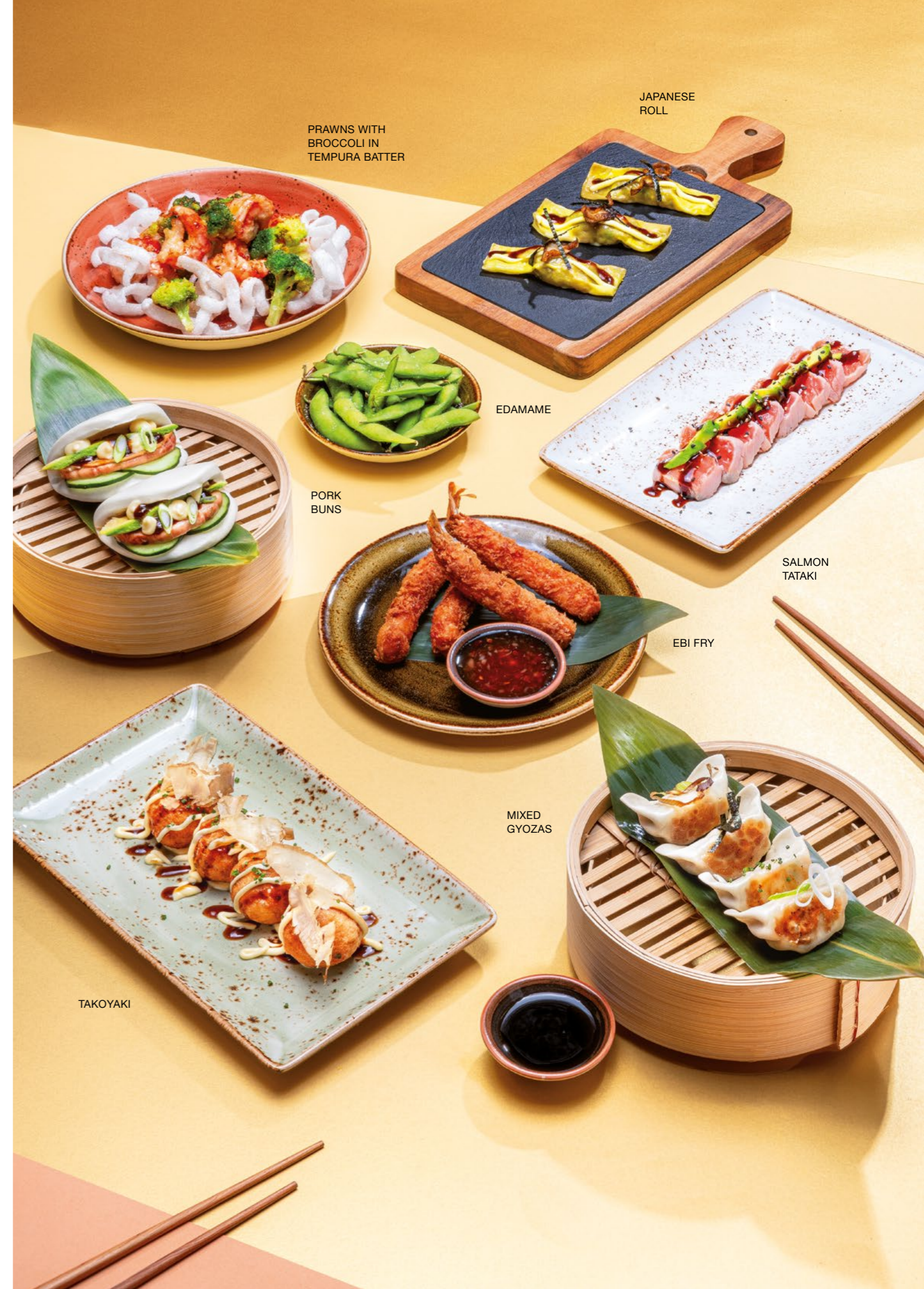
PRAWNS WITH BROCCOLI IN TEMPURA BATTER

Marinated salmon, lightly grilled, thinly sliced and served with teriyaki sauce, diced avocado and sesame