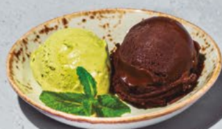
TWO ICE CREAM SCOOPS