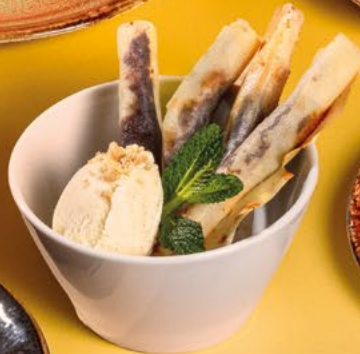
BANANA & CHO-CO