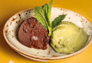
TWO ICE CREAM SCOOPS