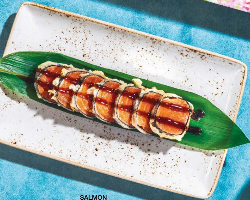
SALMON TEMPURA NORI